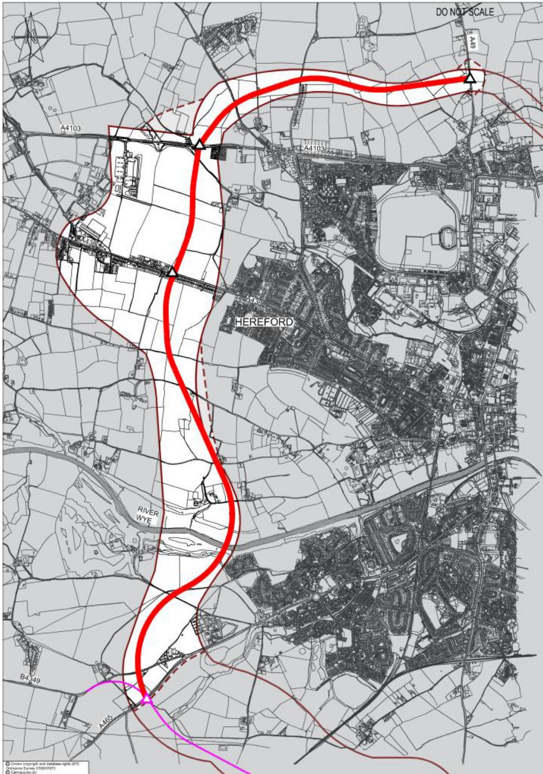
Preferred Route (Appendix 5, Figure 2)

48. The map below shows the recommended preferred route: